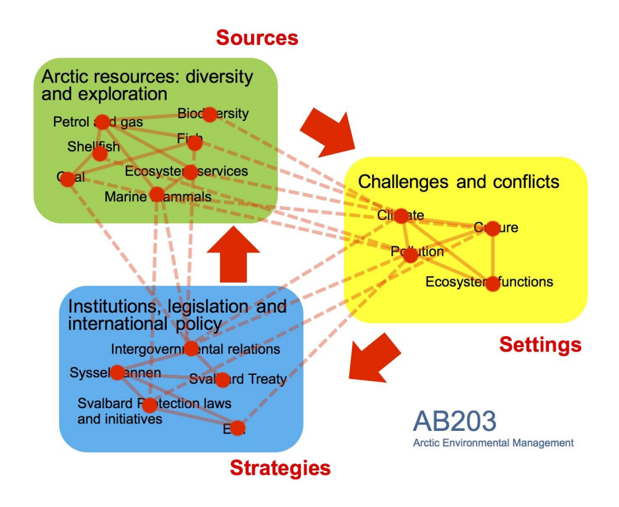
Figure 2. The interdisciplinary complexity of AB-203 divided into three major themes: Arctic resources, Challenges and conflicts and Institutions, legislation and international policy. All three themes are intimately connected; for example, managing marine ecosystems requires considerable ecological knowledge of marine species and their environment, as well as climate impacts, pollution, and intergovernmental relations. The trinity Sources, Settings and Strategies provides the students with overall causal pathway, when working as an environmental manager in the Arctic.

Finally, the students found that using a learning environment where actual teaching activities, such as student-led teachings, also are assessment/evaluation strategies to be very useful in connecting the dots across the very diverse and interdisciplinary course AB-203. Hence, we believe, that using Figure 1b rather than the classic view (Figure 1a) provides a more optimal merger of students, intended learning outcomes, learning environment and activities, assessment strategies and, eventually, actual learning outcomes.